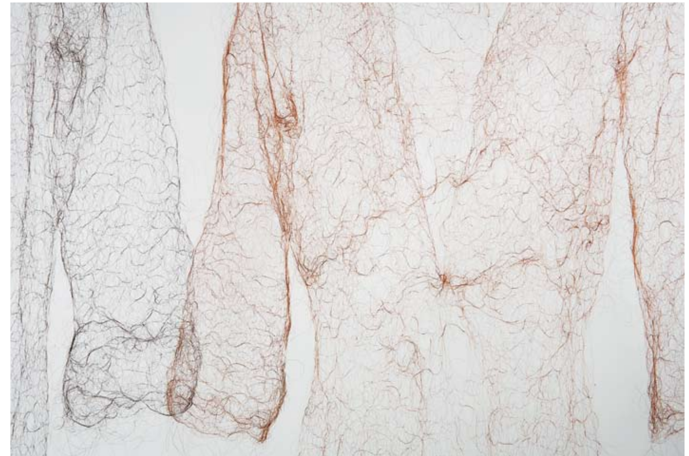
Exhale (detail) 2005 Knitted human hair 198 x 130 x 70cm

This work is born of the desire to provide anchorage for the artist; for the viewer it creates a relentless need to reorient oneself, to find a fictional solid ground. Simultaneously, one peers down into the canal's reflections (the world melts, one cannot grasp it) and looks up into a cold treescape (watery images become arborescent vapours). Still in others, one is constantly displaced - the waters of the canal become dust devils that command the fallen leaves (the world inverted). The viewer revisits the Antipodean artist's experience of a new city - disorientating, reflective and foreign.