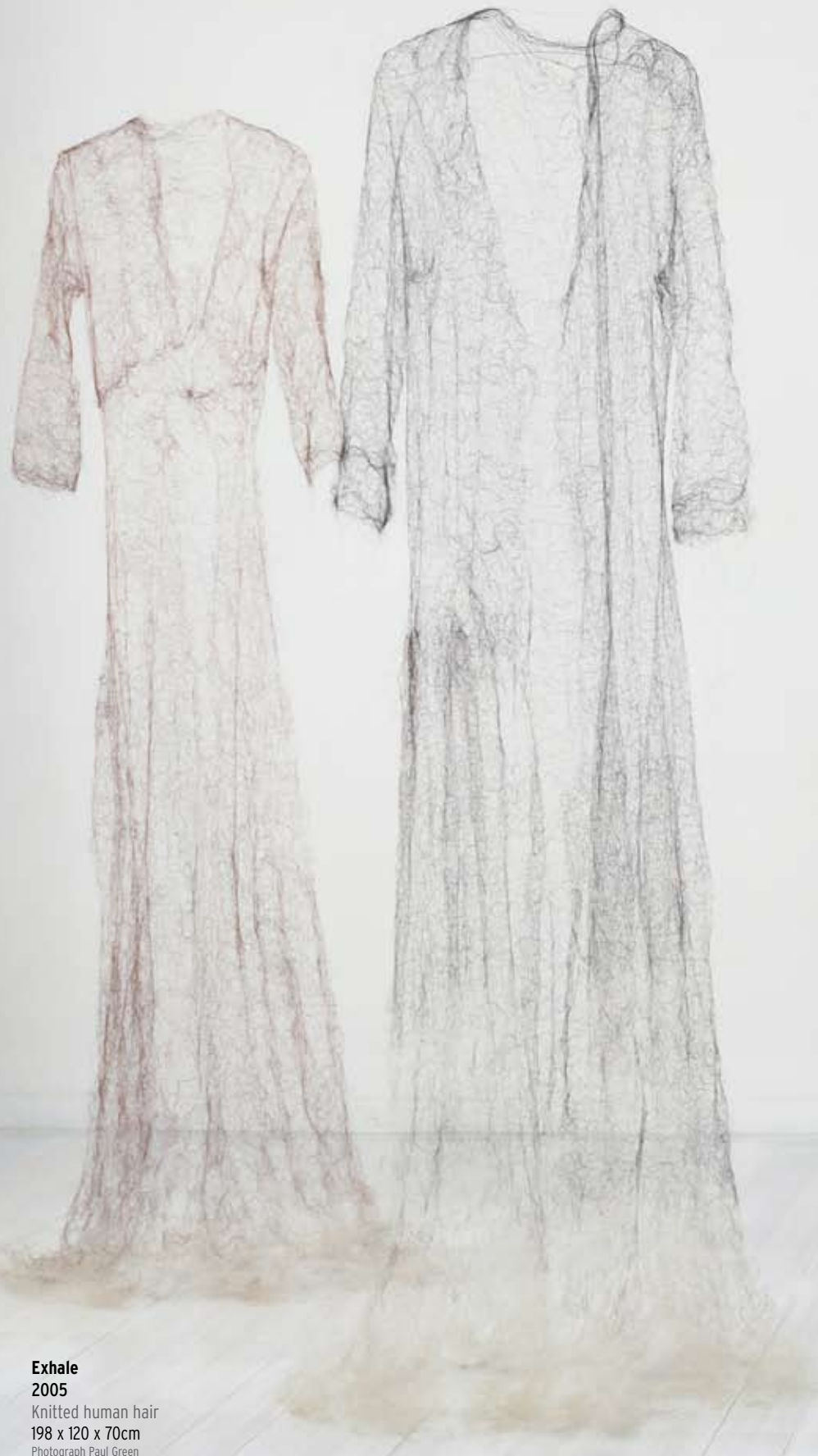
Exhale 2005 Knitted human hair 198 x 120 x 70cm